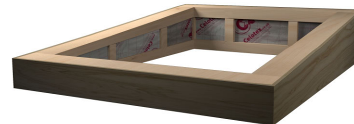
3 3D Framing View