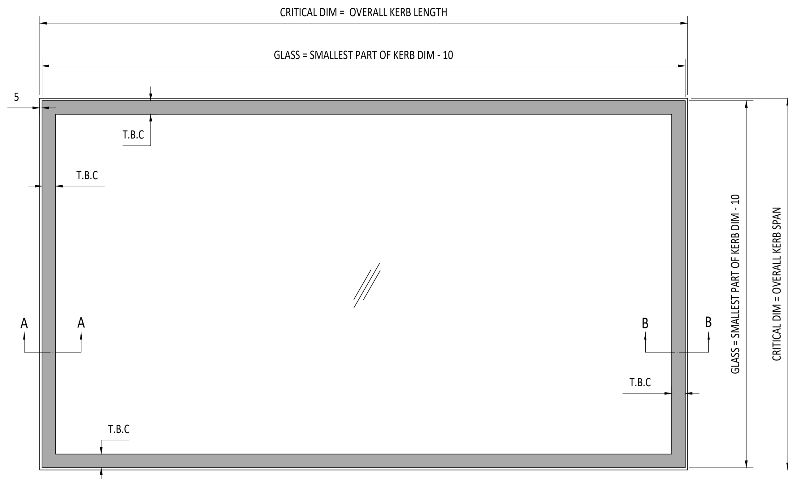
PLAN VIEW True view on slope

UNIT FOR INTERNAL USE ONLY. THIS PRODUCT IS NOT WEATHER PROOF.