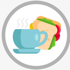
Bringing our own food and drink