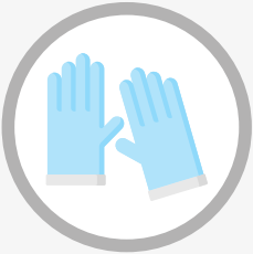
Wearing gloves during installation