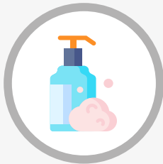
Handwash, soap or alcohol gel