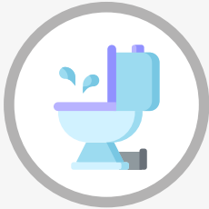
Using toilets away from homes where possible

Throughout your installation, we will minimise the amount of time we spend inside your property.