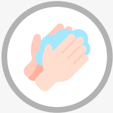
Keeping our hands clean