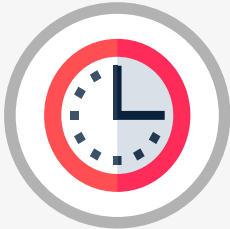
Minimising the time in your home