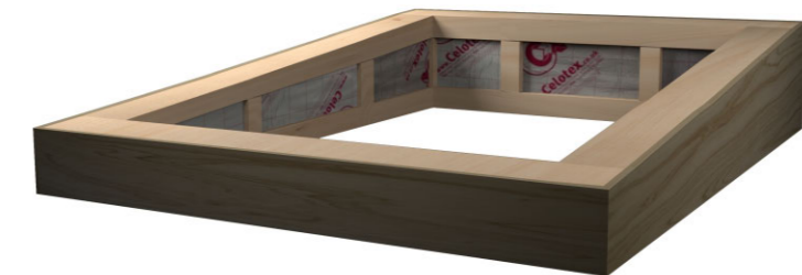
3 3D Framing View